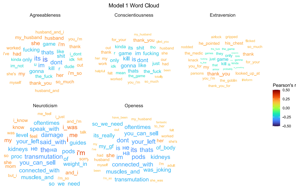
Fig. 2. Word cloud of Model 1 showing the top 20 positive and top 20 negative features that best predict each personality dimension. The size of the word represents the effect size (absolute value of r ) and the color denotes direction (positive or negative).